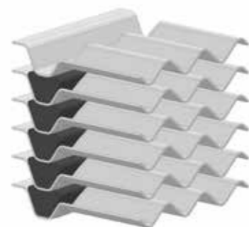
Free Flow Princip

Our extensive range ensures that we can offer the best solution at the best price and, if required, combine several different types of heat exchangers to ensure that you get the best possible solution.